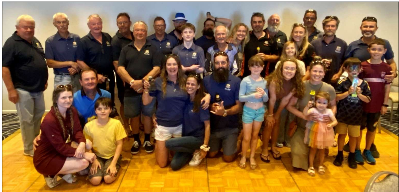
Above: River Heads Fishing Club placed second at this year's Interclub competition.