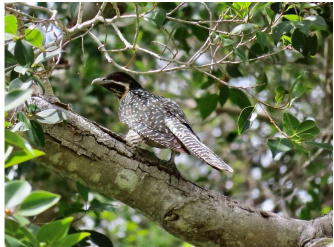
Above top: Male Koel. Below: Female Koel.

foster parent's eggs and aggressively demands to be fed, without the adoptive parents realising they have been duped.